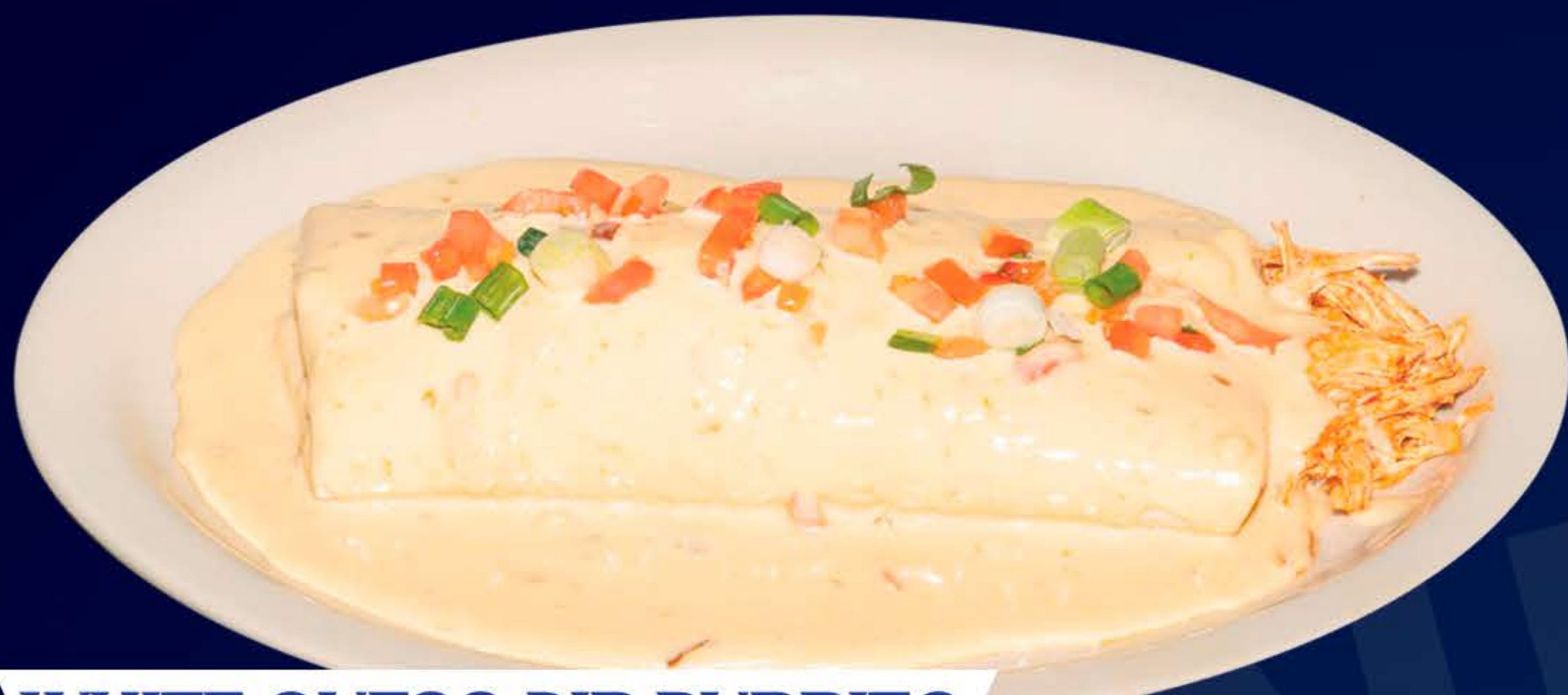
WHITE QUESO DIP BURRITO

One of the best burritos!!! Served with your choice of shredded chicken or ground beef, refried beans, and rice wrapped in a large flour tortilla, topped with green onions and tomato. 14.95