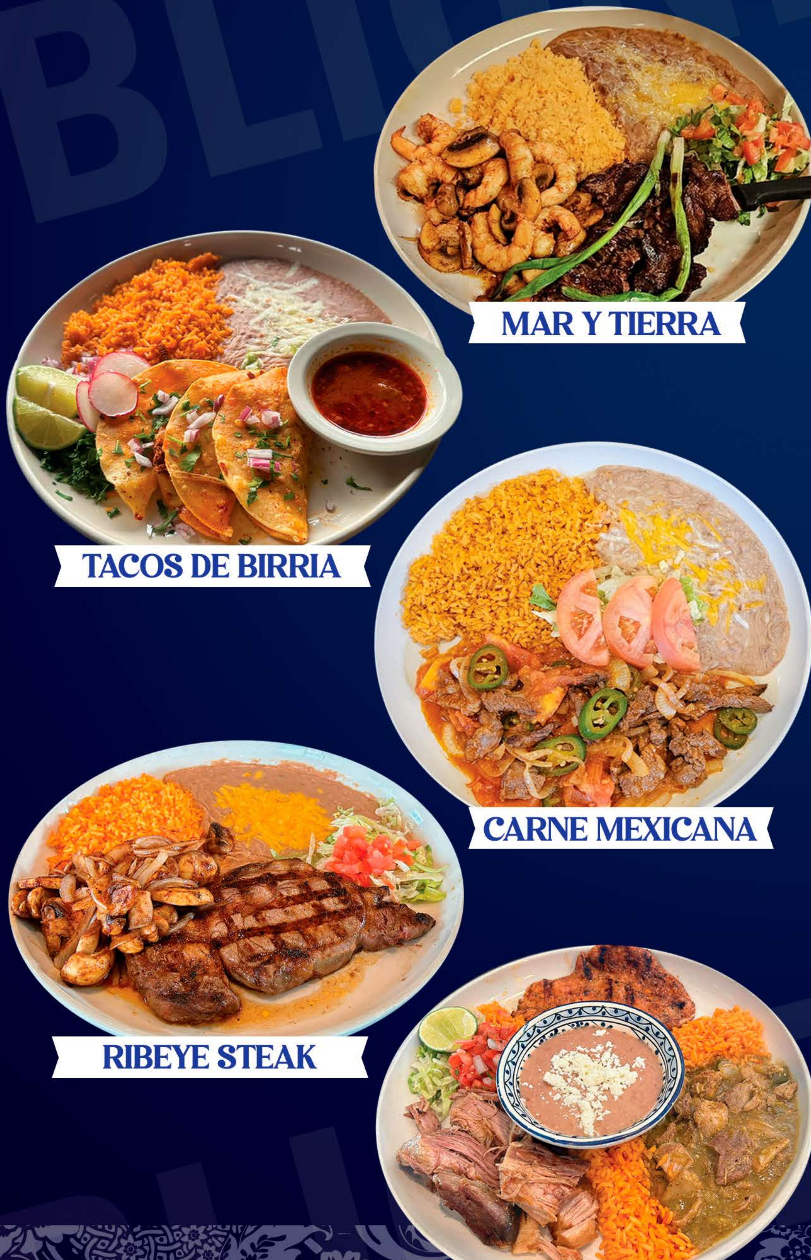
MAR Y TIERRA

Three tacos with traditional stewed meat marinated and seasoned. 22.95