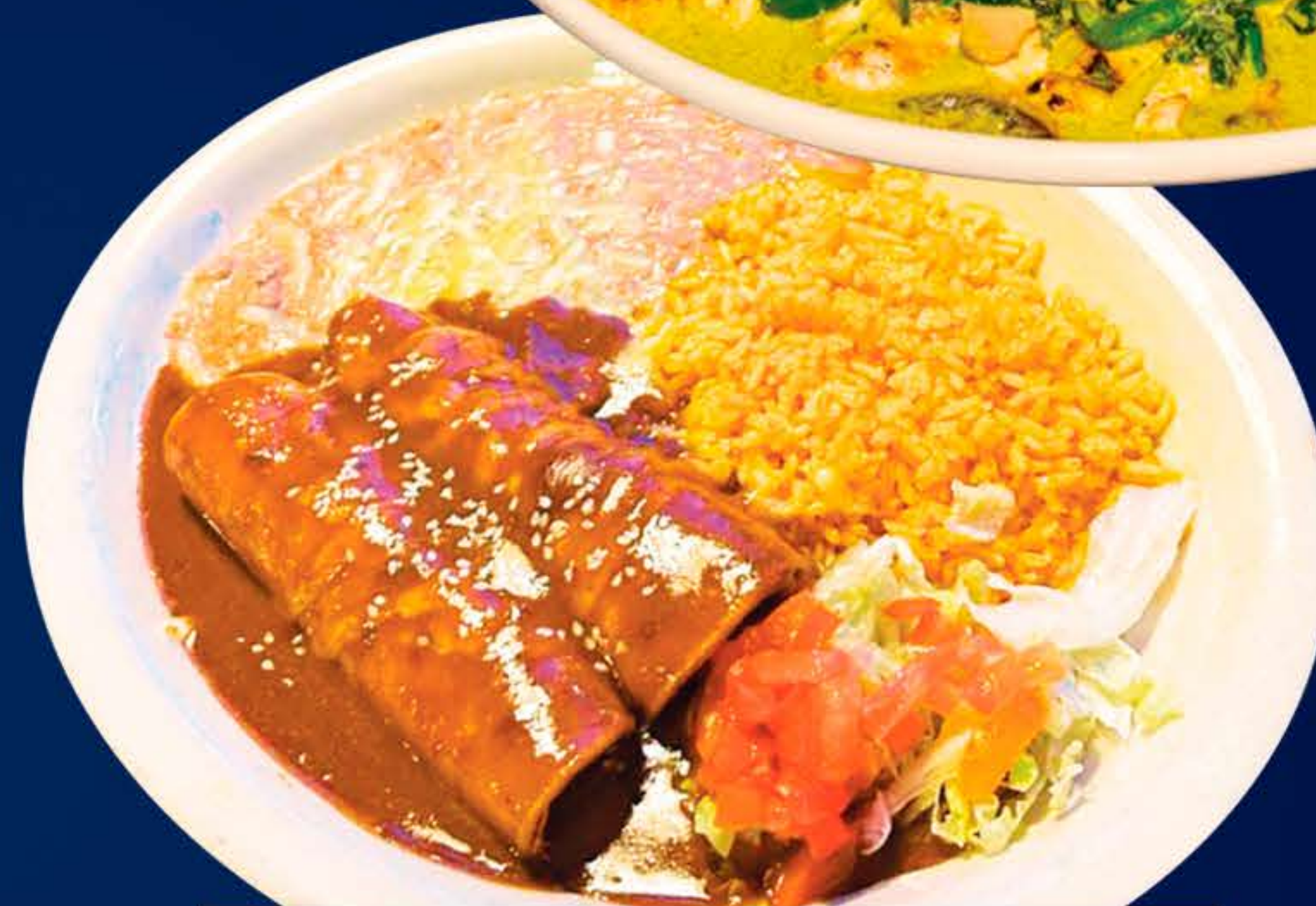
ENCHILADAS DE MOLE