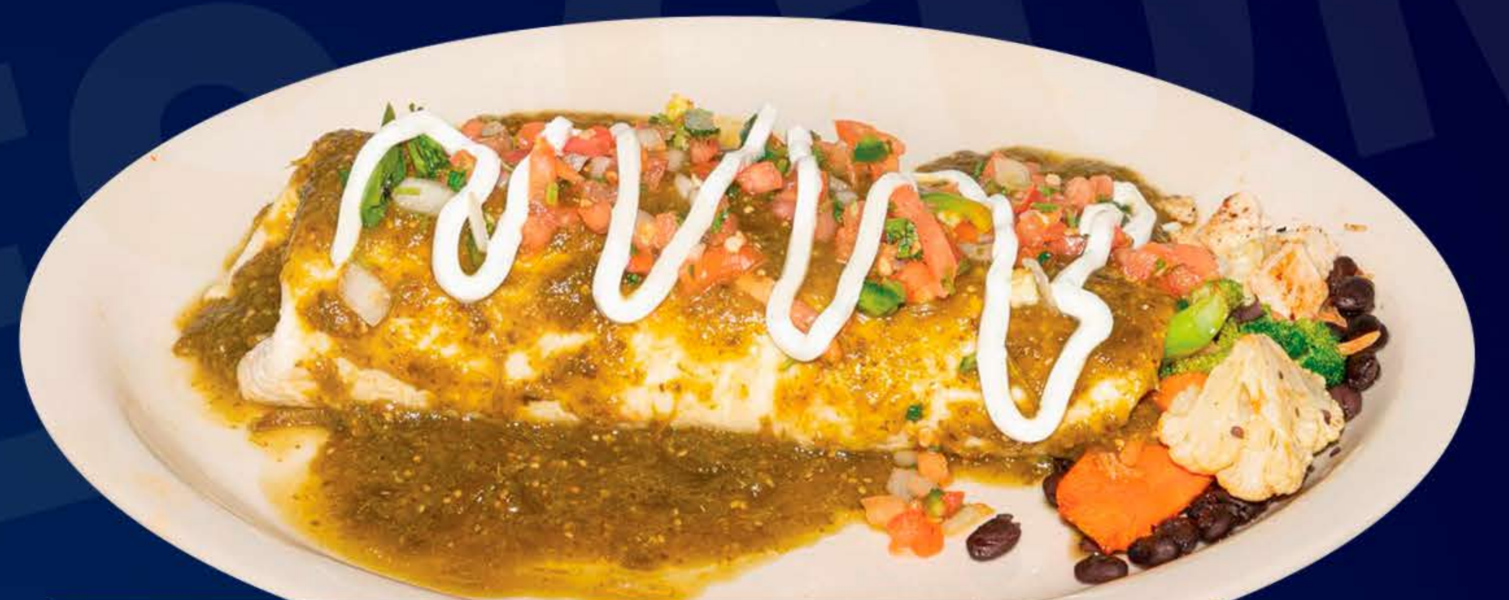
BURRITO DE POLLO ASADO

BURRITO CHIPOTLE A large flour tortilla filled with rice, beans, and your choice of chicken, ground beef, or shredded beef, topped with cheese, chipotle sauce, tomato, and onion. 14.95 🍴