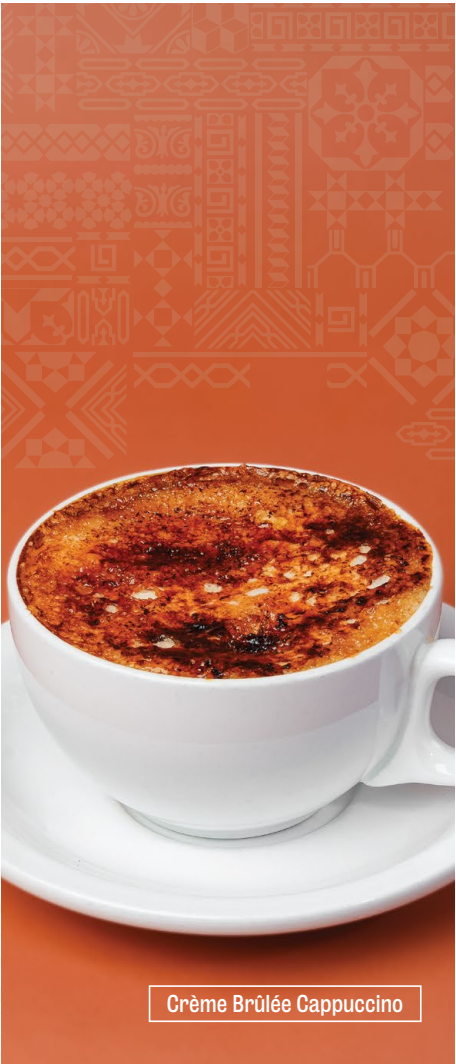
Crème Brûlée Cappuccino

Flavors: Hazelnut, Vanilla, Caramel, Irish cream, Cinnamon, Rose or Coconut