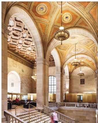
(Crew Collective & Cafe)

Click on the link to check where the places are: https://goo.gl/maps/uFe9ZZqLAMsCX6bV8