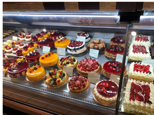
(Boulangerie Premiere Moisson)