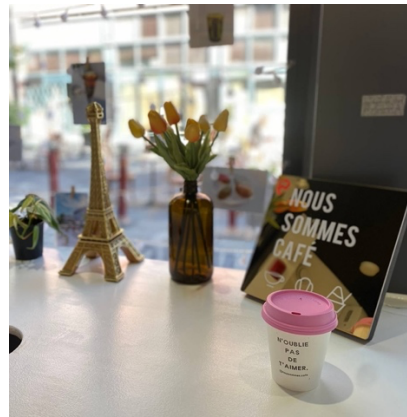
(Nous Sommes Cafe)