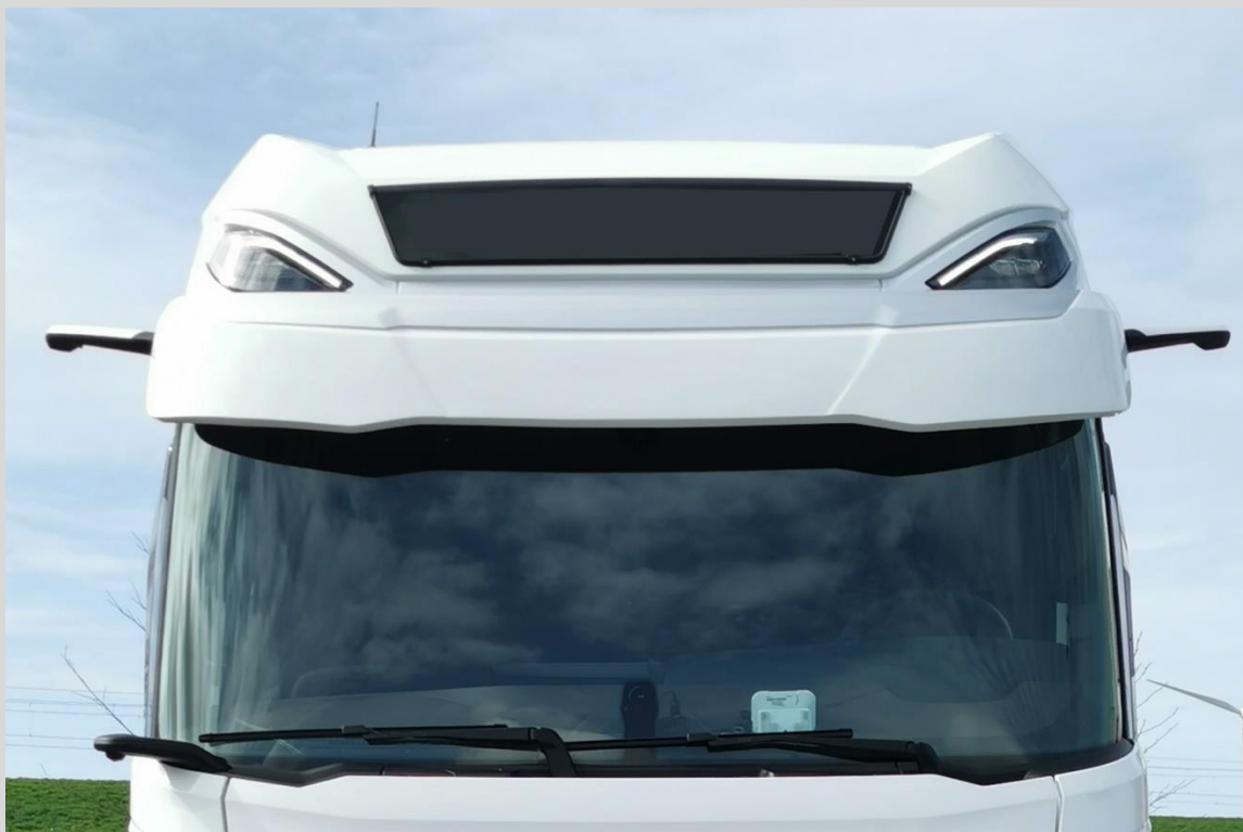
Sunvisor DAF XF/XG/XG+