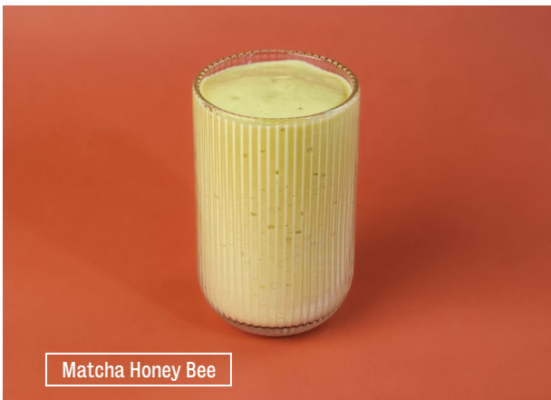
Matcha Honey Bee